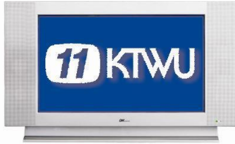
Digital TV Channel 11.2