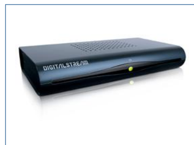
Digital Stream™ Converter Box The first Digital to Analog converter approved by the NTIA coupon program

A unit that sits on top of your existing analog TV set, that receives the Digital TV signal via antenna, then converts it to analog, displaying a converted digital signal on your analog set.