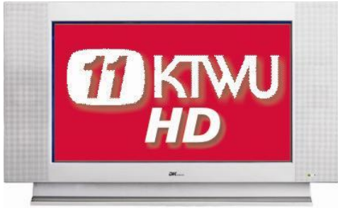
Digital TV Channel 11.1