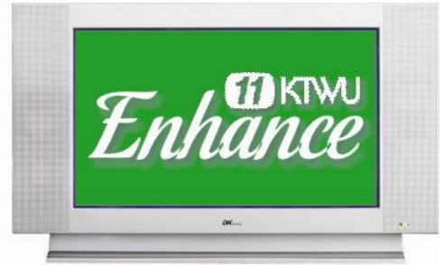
Digital TV Channel 11.3

KTKA Simulcast 49.1 KTKA Local Weather 49.2